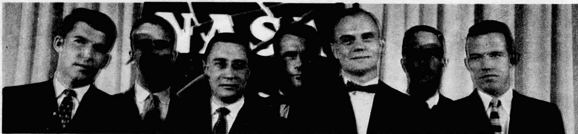
The Man inside the capsule will be one of these (l to r): Lt. Cmdr. Walter Shirra, Lt. Cmdr. Alan Shephard, Jr., Capt. Virgil Grissom, Capt. Donald Slayton, Lt. Col. John Glenn, Lt. Malcolm S. Carpenter, Capt. Leroy Cooper, Jr.

Author of "Rockets and Space Travel" and "The Conquest of Space"