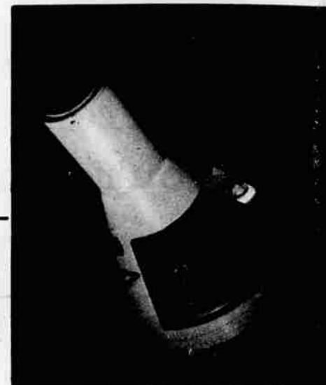
The Goal: A manned capsule orbiting the earth.