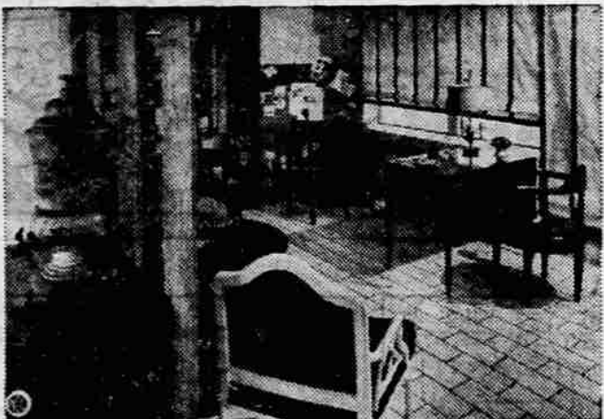
SHADES OF WHITE—A novel window treatment becomes the focal point in this inviting living room by decorator Melanie Kahane, AID, in New York's Washington Square Village. A heavy white cotton striped with acid green binding is used in the draw shade, the overcurtain and tasseled valance. Wood tones in the room are set off by touches of black and green.

Dissolve pineapple gelatin in hot water; add cold water, salt and lemon juice. Chill until slightly thickened. Set bowl of gelatin firmly in bowl of ice. Whip until frothy and light. Fold in whipped cream and chopped nuts. Pile into 1 1/2 quart mold. Chill until firm, about 3 hours. Unmold. Serve plain or with whipped cream. Makes 10 to 12 servings.