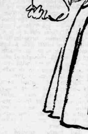
PRINTED PATTERN A581 A Harmay Original

Smartly spanning the summer-into-fall seasons—Harmay's wide, wide collar shelters your shoulders with all the dashing elegance of a cape. Exposing a graceful neckline, it tops a s hape that's easy for one and all to wear—smooth midriff and soft figure-flattering pleats make "little" of your waistline. Picture it in transition cottons that travel the day-to-evening circuit all year 'round, graceful silk surah, faille or gleaming satin for night-time allure. Printed Pattern A581 includes short or three-quarter sleeves for you who wisely use summer leisure to plan a busy and beautiful fashion future.