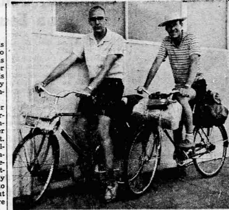
7369 by Alice Brooks

HOTEL MEDFORD 5:30 p.m. till 12:00 Weekdays Sundays 4 p.m. to 11 p.m.