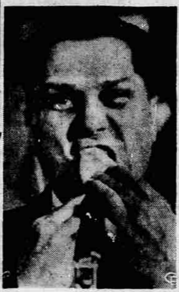
SQUINTING and wiping his face, Teamster President Jimmy Hoffa testifies before Senate rackets committee.

MEXICAN WRITER DIES Mexico City—(UPI)—One of Mexico's leading writers, Jose Vasconcelos, 77, died here Tuesday night. He was a noted philosopher and educator.