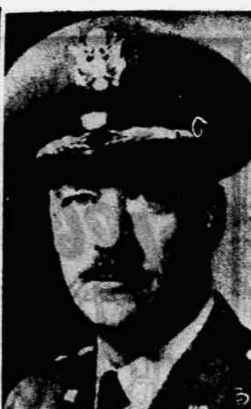
TAKING the helm at the Air Force Academy at Colorado Springs, Colo., is Brig. Gen. William S. Stone.

Poultry, Rabbits Live Chickens - Quoted to growers at Portland, Salem and south to Eugene; f.o.b. ranch. No. 1 quality fryers, 2 1/4-4 lbs., 18c lb.; light hens, 7-8c; heavy hens, 9c. Dressed Chickens - No. 1 grade dressed to retailers: Fryers, whole drawn, 33-35c lb.; cut up, 38-41c; hens, heavy type whole drawn, 33-38c; light-type cut up, 29-34c lb. Dressed Turkeys - To retailers: Frozen ready to cook A grade young toms, 40-45c lb., according to weight. A grade young hens, same basis, 38-40c lb. Breeder Turkeys - To producers: A grade hens, 24c on visceraed basis; A grade toms, 30c on the same basis; to retailers, A grade hens, 20-30c lb. Rabbits (average to growers) f.o.b. killing plants - Live white, 3 1/2-4 1/2 lbs., f.o.b. Portland, 18-21c; colored pelts, 5c under. Fresh killed fryers to retailers, 36-38c lb.; cut up, 60-62c.