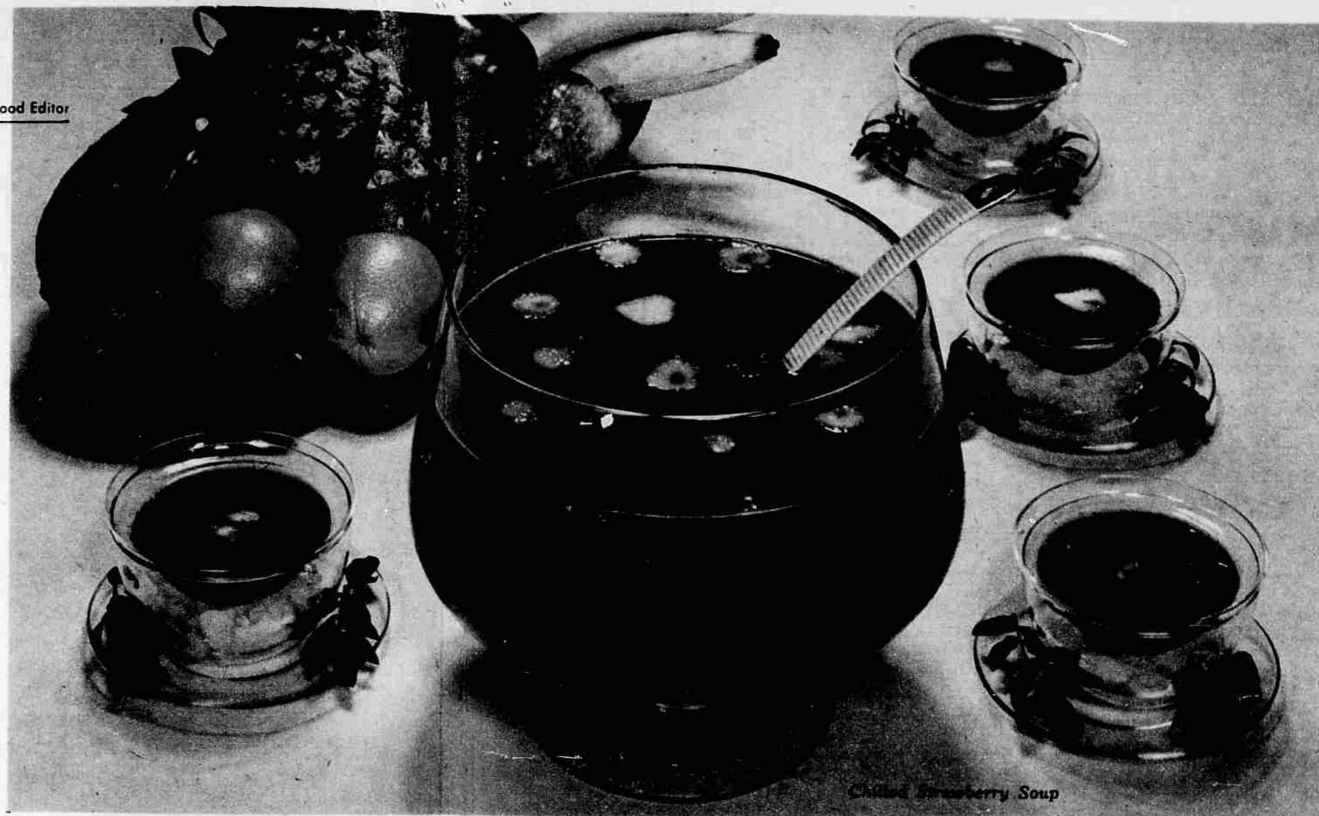
Chilled Strawberry Soup

* For Boiling Water Bath—Set a deep pan on oven rack and place the casserole in the pan. Pour boiling water into pan to level of mixture in casserole.