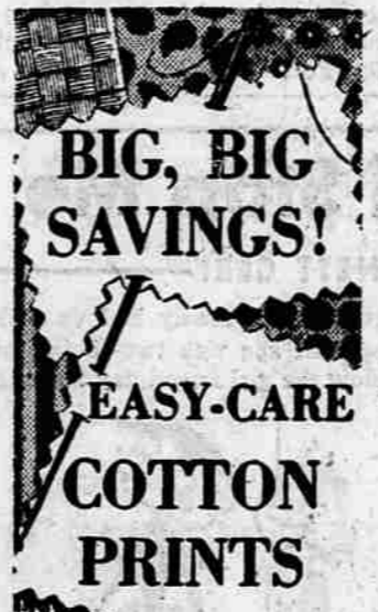
COTTONS IN NEW DESIGNS, COLORS Special! $1 2 Yards

Make a big-line to Penney's for this special slip buy! Perfect quality rayon tricot in white and pastels . . . easy-care, never needs ironing. Choice of three styles. In sizes 32 to 40.