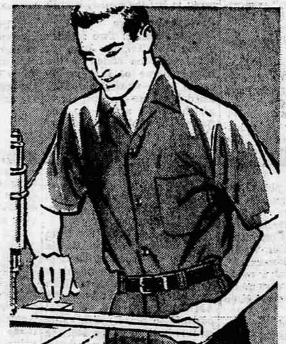
MATCHED SET VALUE

Working or playing . . . our sturdy twill breeze thru summer. Pants have brass zipper, cuffs and the shirts boast a dress collar, long sleeves! Sanforized! Khaki, grey.