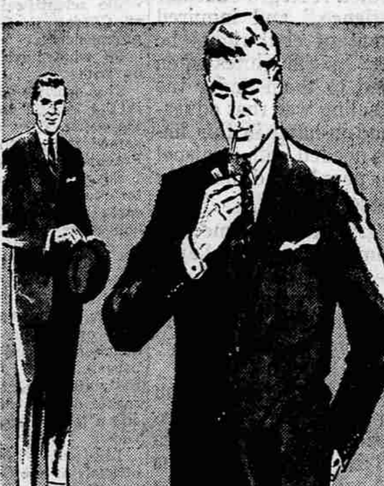
COOL, TROPICAL SUITS

While 40 suits last. You can get Penney's fine summer weight dacron and wool suits or the famous wash 'n' wear suits. Keep cool—and keep comfortable all through the summer. All perfectly tailored and fitted to Penney's high quality standard. Save now!