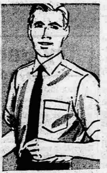
AIRY DRESS SHIRTS EASY ON CARE! Only! $2

Scores of prints to choose from. All little or no iron beauties! Perfect for dresses, sportswear, pert home decorations!