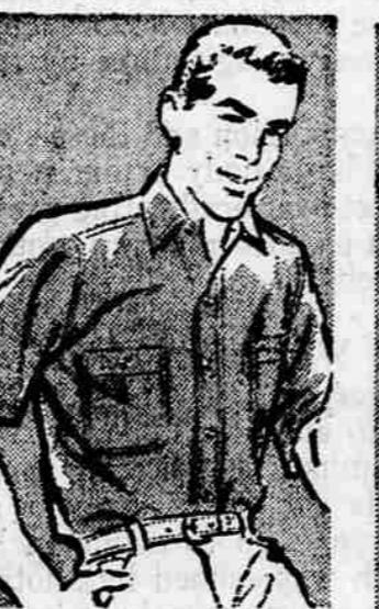
BLUE CHAMBRAY WORK SHIRT BUY Special! $1

Tailored for summer comfort, combed cottons in a cool skip-dent or mesh weave. Short point collar, permanent stays. Machine wash! Little or no iron!