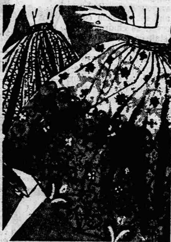
WO'S COTTON SKIRTS

It's a skirt-n-bouse season and these cool cottons come in summer's gayest blend of colors. Floral prints or solid tones. Many styles to please your fancy. And so reasonably priced you'll want more than one. Sizes 10 to 18.