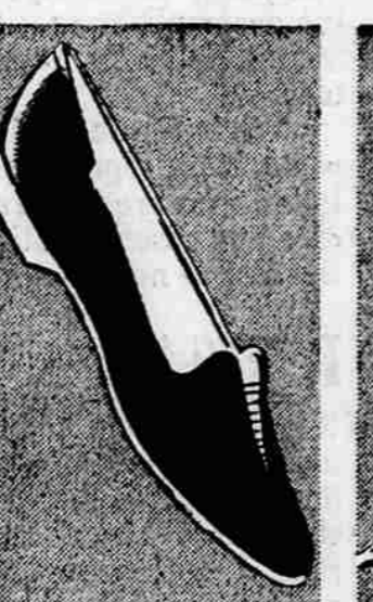
WO'S WASHABLE SAILCLOTH SLIP-ONS Only! $2

Cool 4.4-ounce chambrays Penney tailored the way you want 'em . . . lined collar, double shoulder yoke, long tails and matching blue buttons. Sanforized!