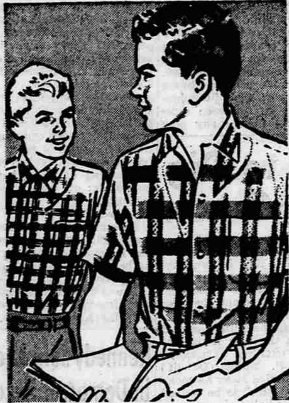
BOYS' SPORT SHIRTS

Penney's tailors these fine Dan River cottons with every smart, good-looking feature . . . 2 matching pockets, cool short sleeves! Then prices them 'way low for exceptional savings! Great shirts for summer. Assorted patterns and colors. 4 to 18.