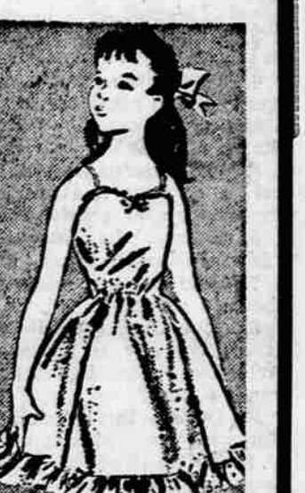
SPECIAL BUY! PLISSE SLIPS! Now! 66c Sizes 4 to 14

Pretty new vacation or "at home" footing. Washable sailcloth slip-ons with "stay put" elasticized insteps. Colors trim edges. Sizes 5 to 9.