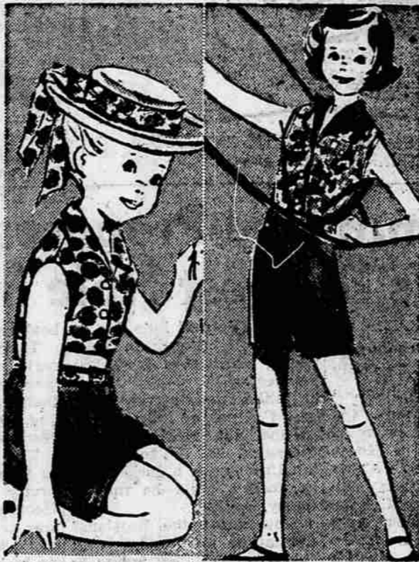
2-PC. PLAY SET

Very special purchase on these smartly styled cool, cotton play sets. Printed sleeveless blouse toppers with matching shorts. Machine washable. Complete set at a price you would expect to pay for the short or blouse alone.