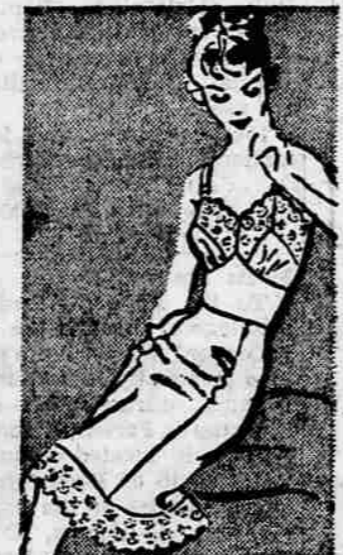
BIG BUY! WO'S RAYON SLIPS Special! $1

Just arrived! A new shipment of hundreds of new summer straws gayly decorated under washable protective clear vinyl. Great the summer days with a new bag in your hand.