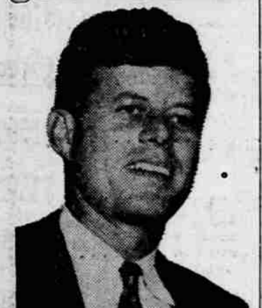
by Sen. John F. Kennedy

He would have to be extraordinary, but a distinguished senator—himself a presidential aspirant—believes a woman might become our chief executive in our generation. His bold story is in the