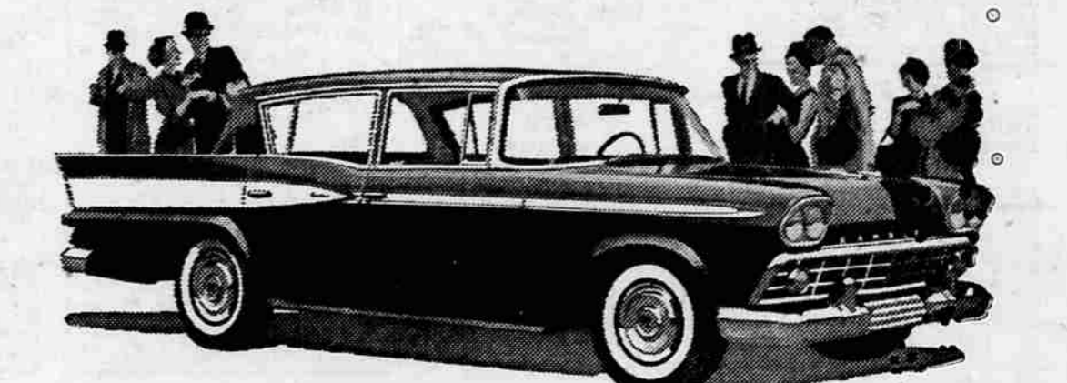
The Compact Rambler... America's No. 1 Success Car

AMERICAN MOTORS CORPORATION RAMBLER • KELVINATOR • METROPOLITAN