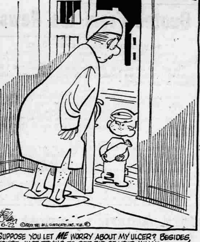
"SUPPOSE YOU LET ME WORRY ABOUT MY ULCER? BESIDES, YOU'RE JUST TRYING TO GET RID OF YOUR MILK!"