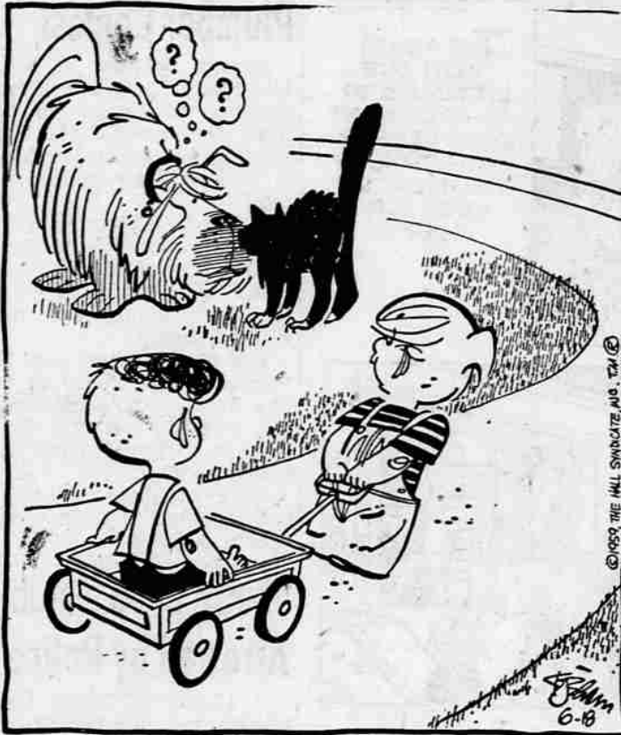
"RUFF LIKES TO CHASE CATS... IF THEY'RE POINTED THE RIGHT WAY."