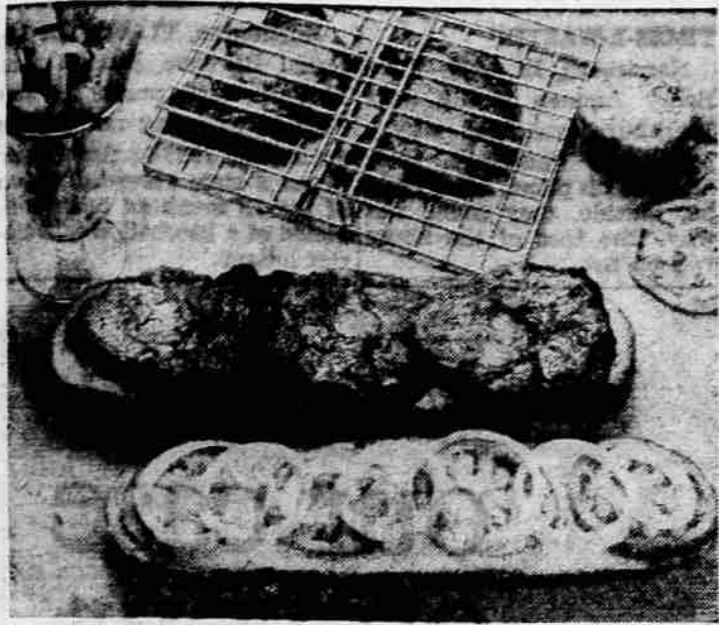
STEAK FOR FATHER - Let George do it! Whether the George in your life does the whole works from steak buying to broiling or merely assembles the finished product for pure enjoyment, steak's the thing for Father on his day.