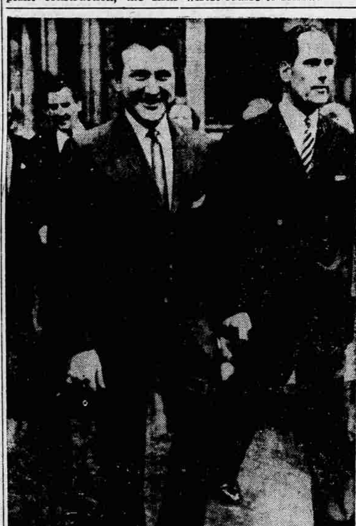
LIBEL SUIT —American pianist Liberace (left, smiling) walks into court in London, where he is suing British columnist "Cassandra" for suggesting that Liberace is a homosexual. "Cassandra" is a columnist for the London Daily Mirror, real name William Neil Connor. Man is right is unidentified.