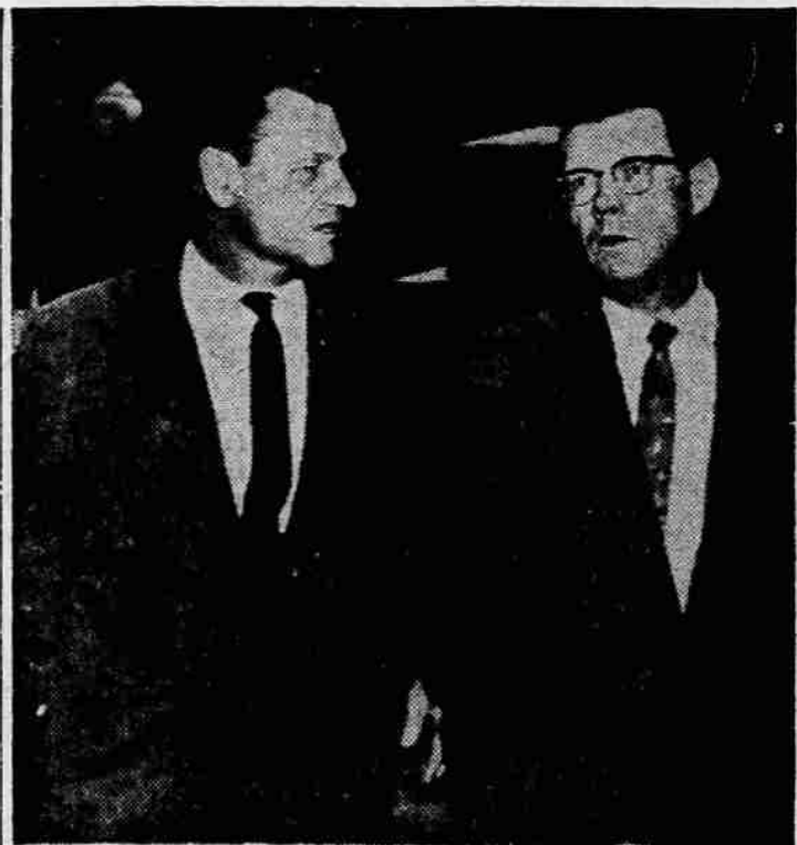
"MUTUAL PROBLEMS" —Nelson Rockefeller, governor of New York, leaves the White House in Washington, accompanied by James Hagerty (right), Presidential news secretary. Rockefeller conferred with the President for about 30 minutes on what he described as "mutual legislative problems."

Best prospect to turn the transportation tide is a high-speed monorail system. The plan now is under study by