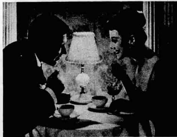
No need to starve. That's the painful way to reduce, and not the best way. Besides taxing your willpower, a "starvation" diet often takes weight off in the wrong places. Stauffer Home Plan includes sensible caloric reduction. This, with the Magic Couch, trims extra pounds evenly.