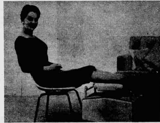
Lose where you need to lose. The Magic Couch (Posture-Rest®) adjusts to many positions, lets you concentrate on any "problem area." (There's even a position for ankles!) While helping to slim you, the Magic Couch also firms you. Unlike many reducing methods, it tones up muscles.