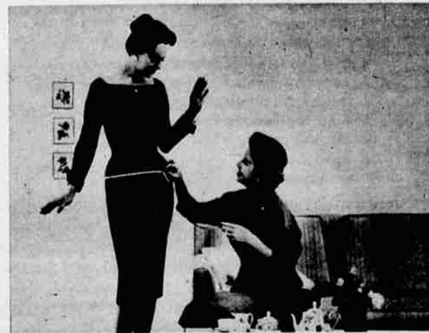
Personal guidance. When you start with Stauffer, a highly trained counselor calls at your home—analyzing your figure and tailoring a program to your unique needs. She calls back often (without charge) to check your progress. Most plans offer no guidance—after you buy, you're "on your own."