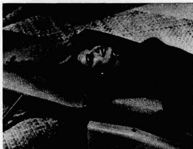
Exercise without effort is yours with the Magic Couch. You relax, the couch does the work! With a gentle, pleasant motion, it helps trim inches off waist, thighs, hips... wherever you say. No more violent "workouts"! With Stauffer, you get the necessary exercise, but get it the easy way.

tated its appearance, but are far from alike in results. Most are mere vibrators which can't provide real exercise. The Magic Couch has a controlled, rhythmic motion, giving the thorough, deep-down exercise you need to help reduce.