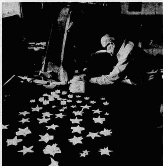
The starmaker has had to accelerate his pace to keep up with new additions to the flag.

Maybe a better solution is the one devised by a Richmond, Va., firm. "We're switching over to Confederate flags," the owner said. "That design hasn't changed in almost a hundred years!"