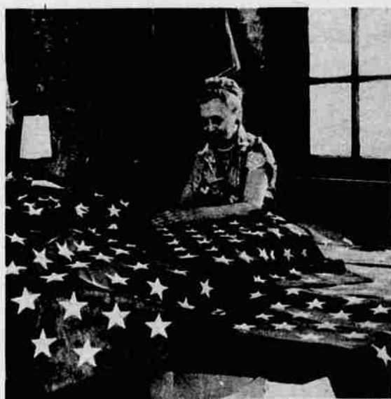
Seamstresses spent years working on 48-star flag, then witnessed two changes in months.