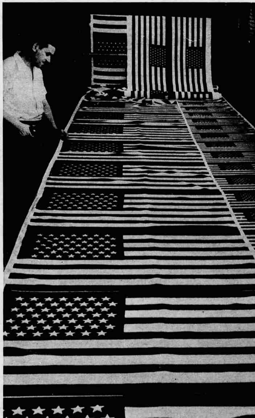
These flags will be historical curiosities—obsolete before introduced.