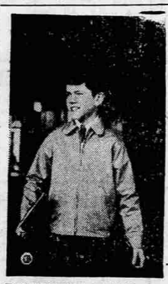
BEST-DRESSED—He'll be the envy of his classmates in this all-cotton jacket lined in a paisley print. The jacket is styled by Pickwick Knitting Mills in Galey and Lord Tarpooon cloth, Zelan treated to shed water and spots.