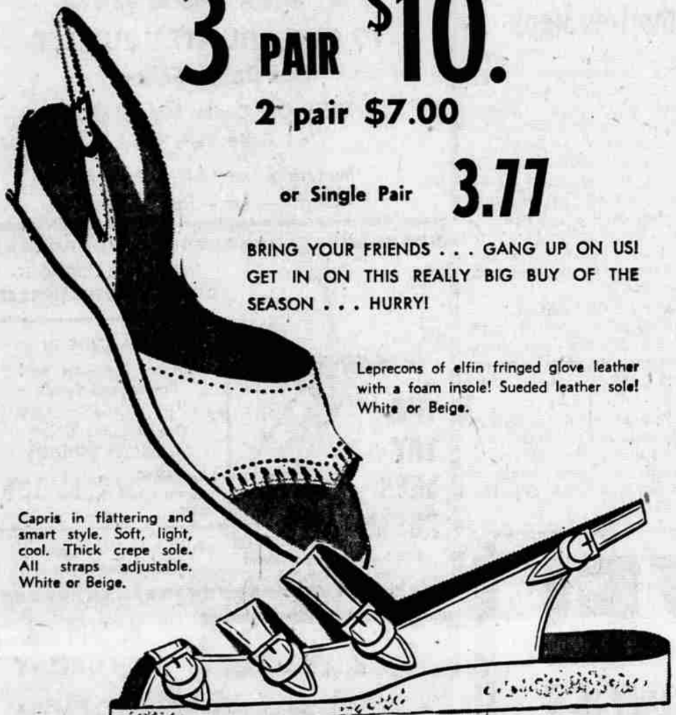
Leprecons of elfin fringed glove leather with a foam insert! Sueded leather sole! White or Beige.

BRING YOUR FRIENDS . . . GANG UP ON US! GET IN ON THIS REALLY BIG BUY OF THE SEASON . . . HURRY!