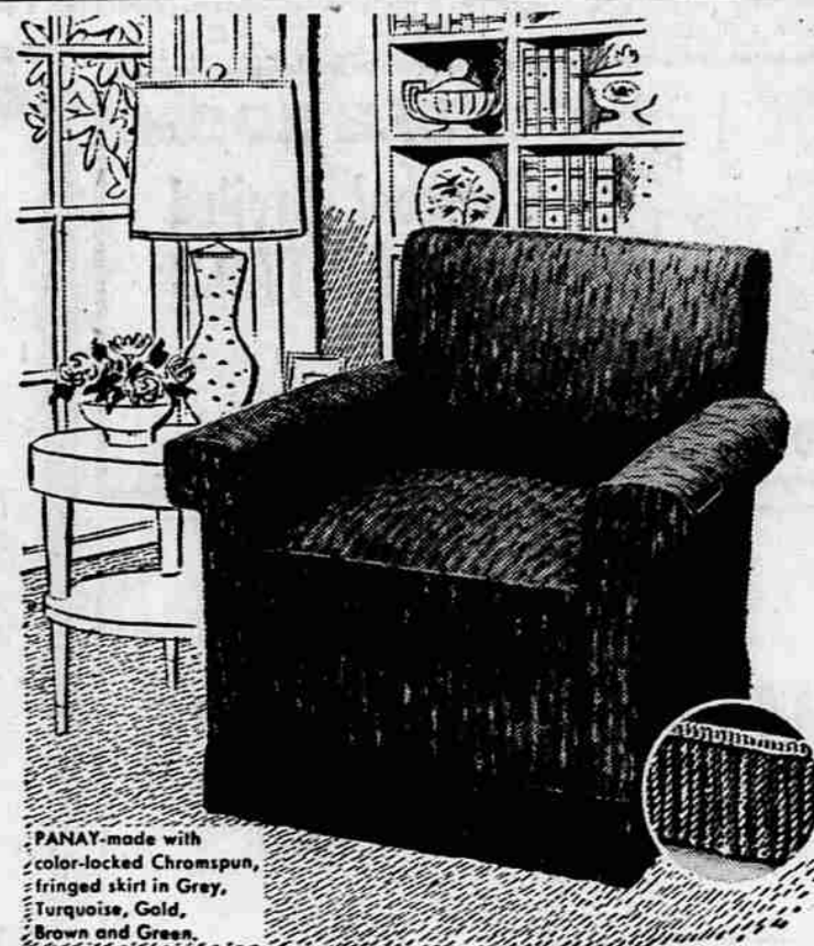
PANAY—made with color-locked Chromspun, fringed skirt in Grey, Turquoise, Gold, Brown and Green.

it's here . . . the Shelton Stroller for June