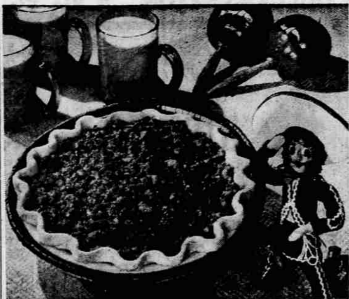
PIE POPULARITY —Corn meal pies enjoy tremendous popularity because of their versatility. Today's food columns suggest four fillings that make fine eating and will enhance your reputation when you take one to a no-host party.

The first steam locomotive to operate commercially in the U.S. was the Stourbridge Lion which was imported from England in 1829.