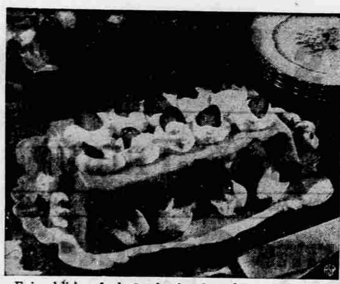
Enjoy delicious fresh strawberries often while they are in season. This delightful whipped dessert stars fresh strawberries and cream in whipped strawberry-flavored gelatin. It's easy to prepare and attractive as well.

Calendar notices and news for the society section of The Mail Tribune must be submitted in writing and deadline for the Sunday edition is 1 p.m. Friday. Deadline for the weekly calendar is 9 a.m. of the day of publication and for week day news is 5 p.m. the day before publication.