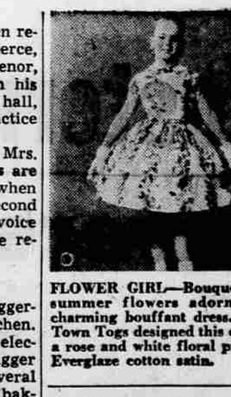
FLOWER GIRL—Bouquets of summer flowers adorn this charming bouffant dress. Tiny Town Togs designed this one in