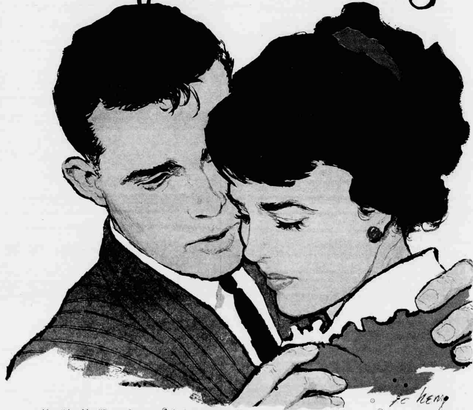
He said softly, "Do we live your father's way or ours?"

Listerine stops bad breath 4 times better than tooth paste!