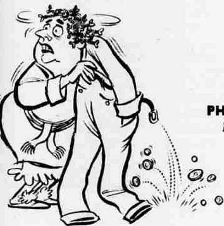
PHONOPHOBIA Fear of noise