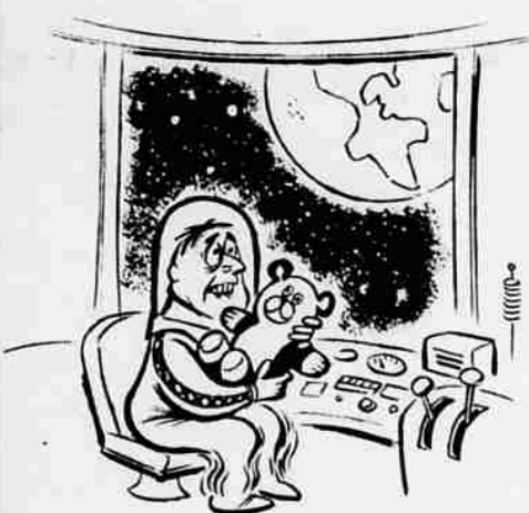
MONOPHOBIA Fear of being alone