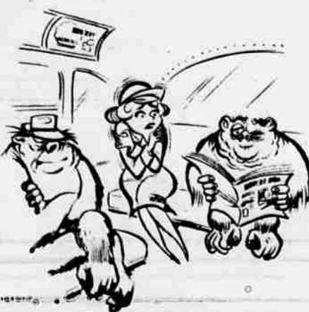
APHNEPHOBIA Fear of being touched

DO YOU HAVE any phobias? Of course you do. Everyone is somewhat afraid of something—usually many things. There's nothing really wrong with having a phobia, unless it becomes an obsession. It's perfectly normal to have several mild phobias, whether you recognize them or not.