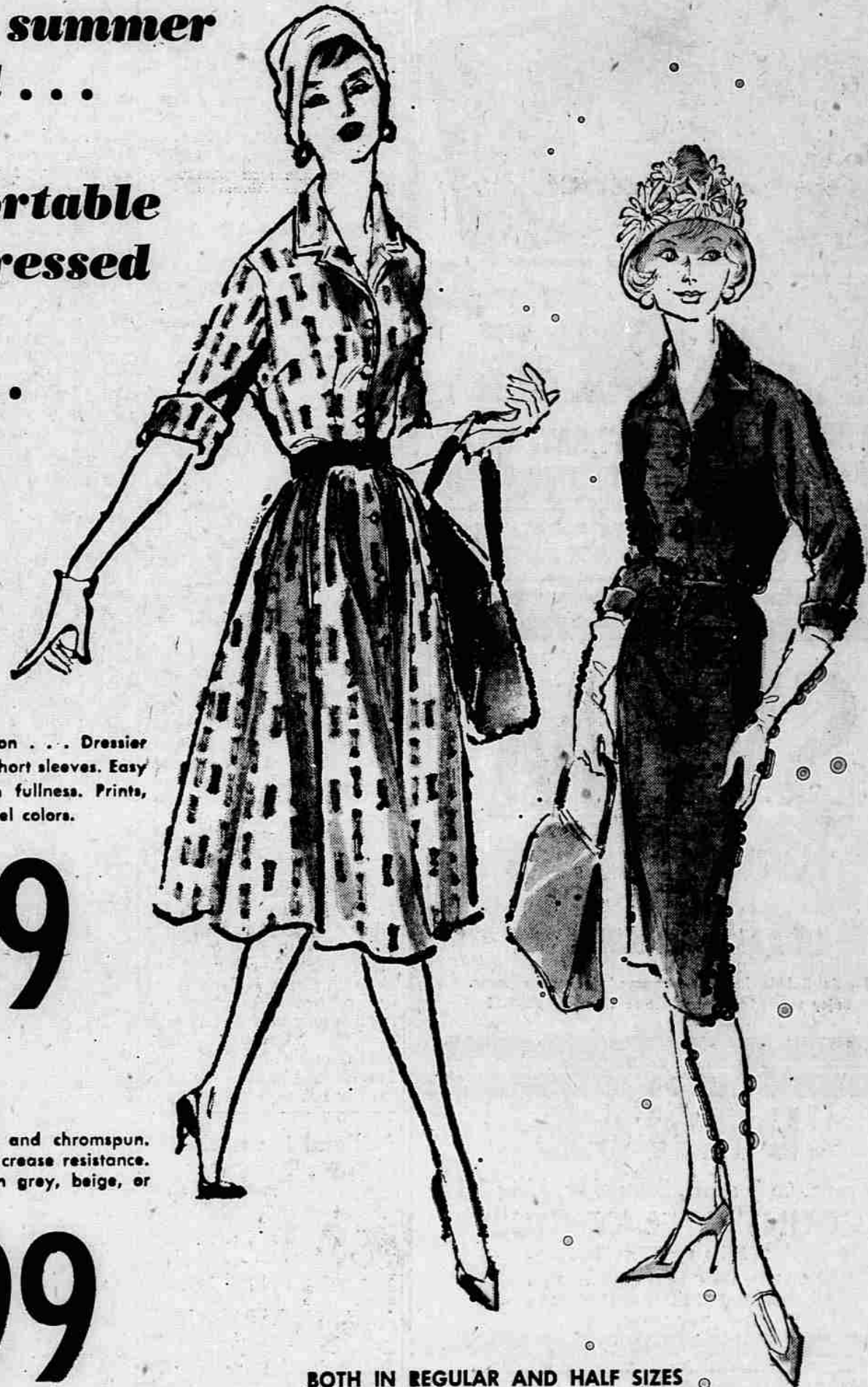
BOTH IN REGULAR AND HALF SIZES

Shirtwaist styles in eyelash cotton . . . Dressier styles with lower neck lines and short sleeves. Easy to wear skirts with just enough fullness. Prints, woven stripes and plains in pastel colors.