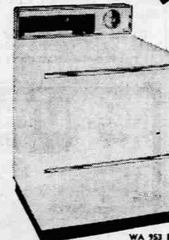
WA 153 R