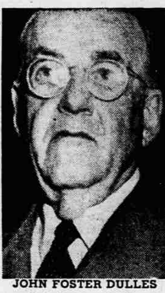
JOHN FOSTER DULLES End Comes Quietly

FORECAST: Considerable cloudiness tonight. Chance of a few light showers. Partly cloudy Tuesday. Airport low 40. High Tuesday 65-68. TEMP. Highest Yesterday 80. Lowest This Morning 42. Our Skies Tonight Sunset tomorrow 7:35 p.m. Sunrise tomorrow 4:41 a.m. Moonrise tonight 10:49 p.m. Lost Quarter May 29 PROMINENT STAR Regulus, in the west at moonset. VISIBLE PLANETS Jupiter, low in southeast 8:33 p.m. Venus, sets 10:32 p.m. Saturn, low in southeast 11:18 p.m. Mars, sets 10:52 p.m.