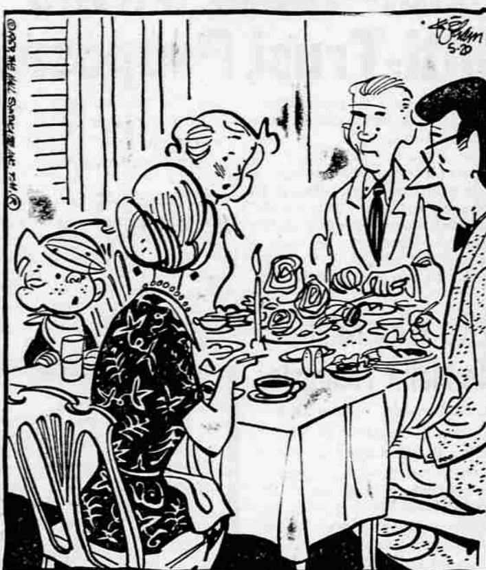
MRS. COGLEY, I DROPPED MY FORK. AN' IT'S GOT SOME GRAVY AN' POTATOES ON IT.....