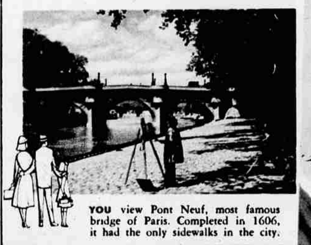
YOU view Pont Neuf, most famous bridge of Paris. Completed in 1606, it had the only sidewalks in the city.