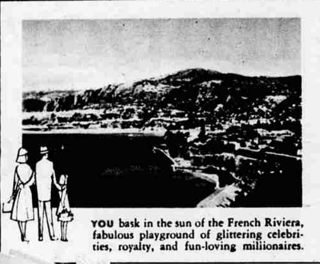
YOU bask in the sun of the French Riviera, fabulous playground of glittering celebrities, royalty, and fun-loving millionaires.