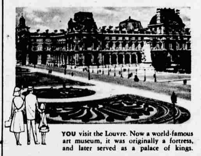
YOU visit the Louvre. Now a world-famous art museum, it was originally a fortress, and later served as a palace of kings.