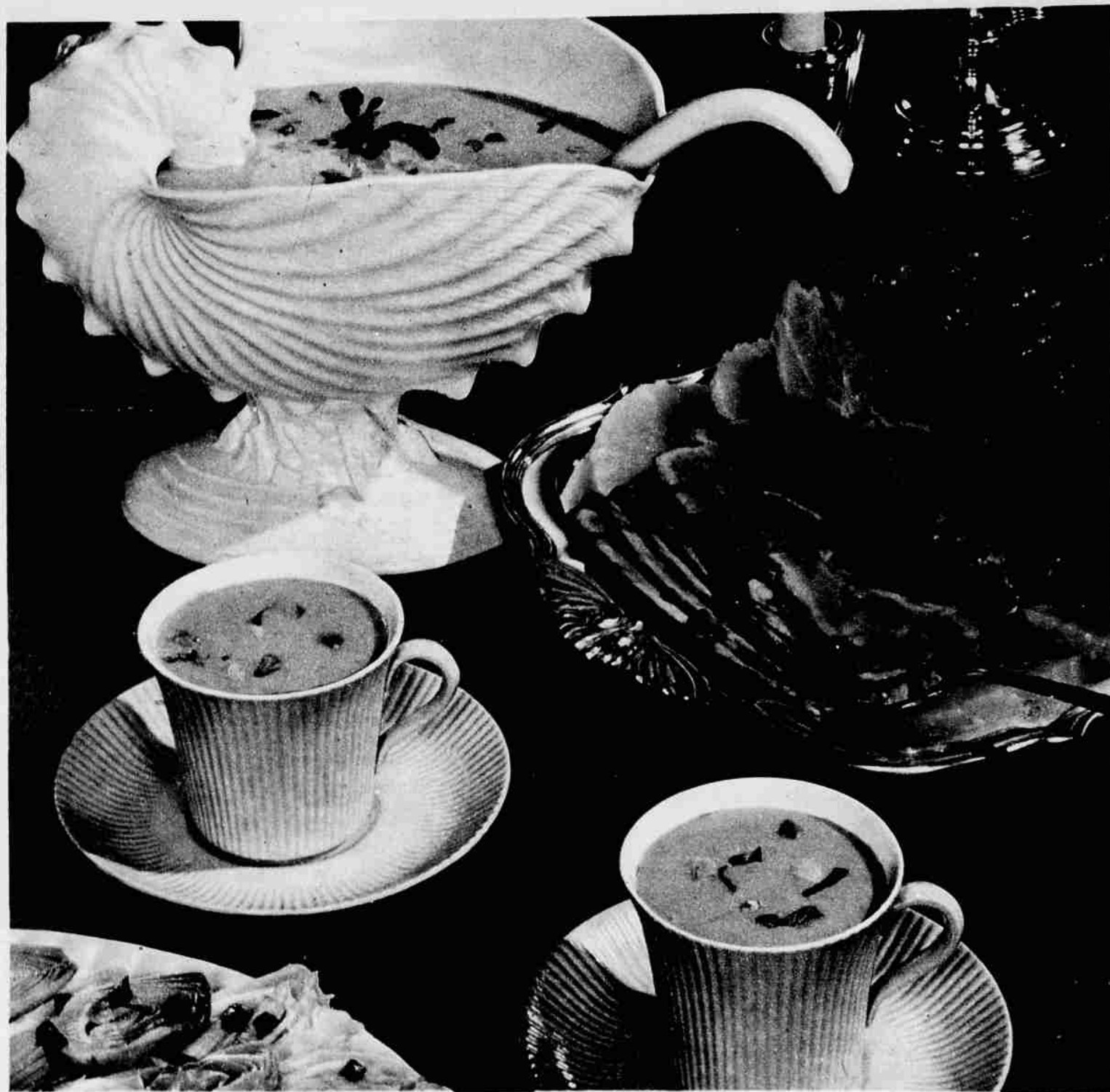
A tureen of delicately flavored Water-Cress Soup and an attractively glazed ham are starring party performers.