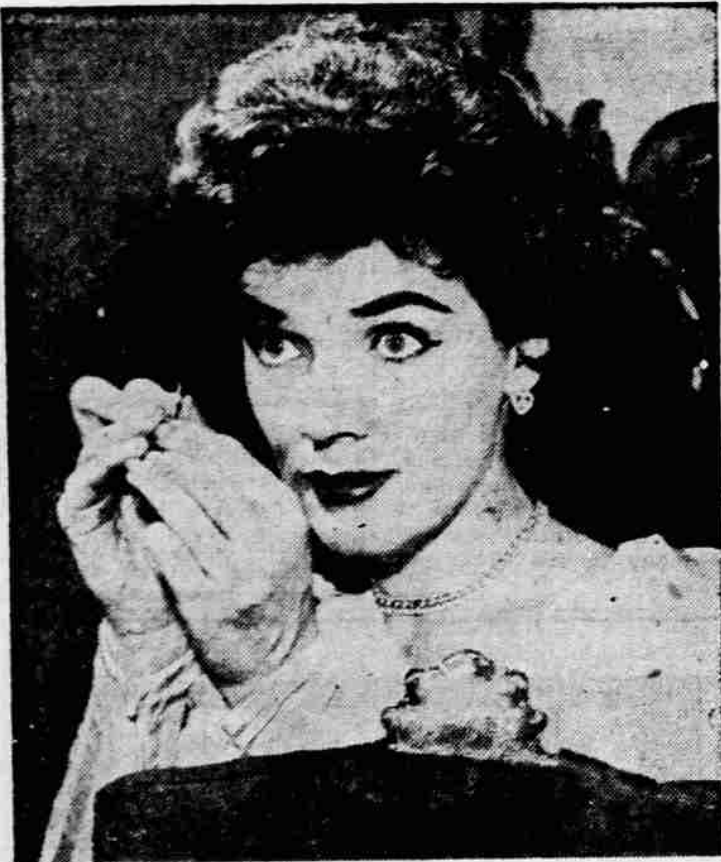
EMERGENCY SURGERY —Singer Polly Bergen, shown here in her dressing room at the New York theater where she has been starring in the Broadway musical "First Impressions," was rushed to the hospital for emergency surgery because of complications of a pregnancy. She came through the surgery satisfactorily and doctors at the hospital say her condition is good.