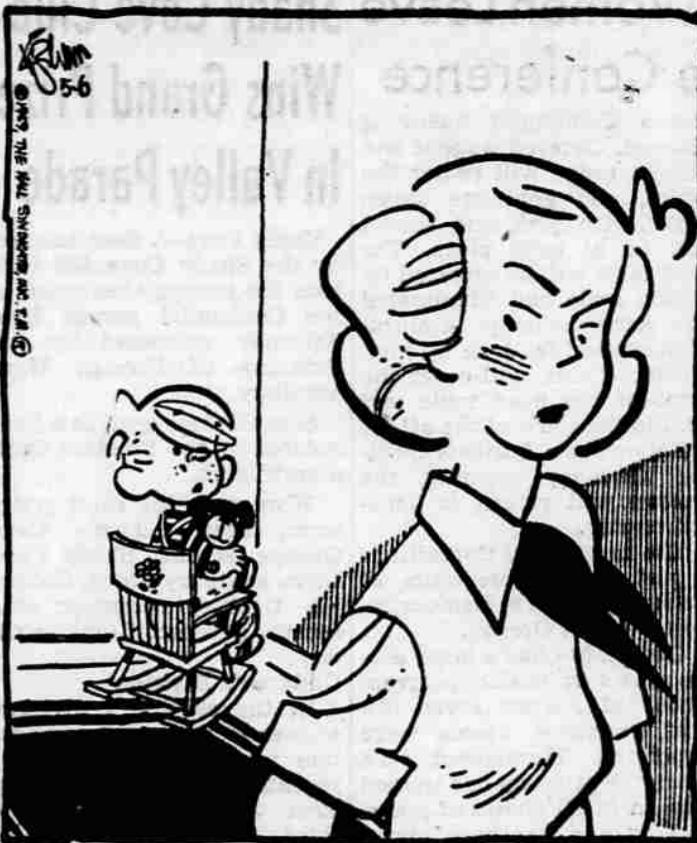
"I JUST LOST MY TEMPER. YOU DON'T REALLY GIVE ME A PAIN."