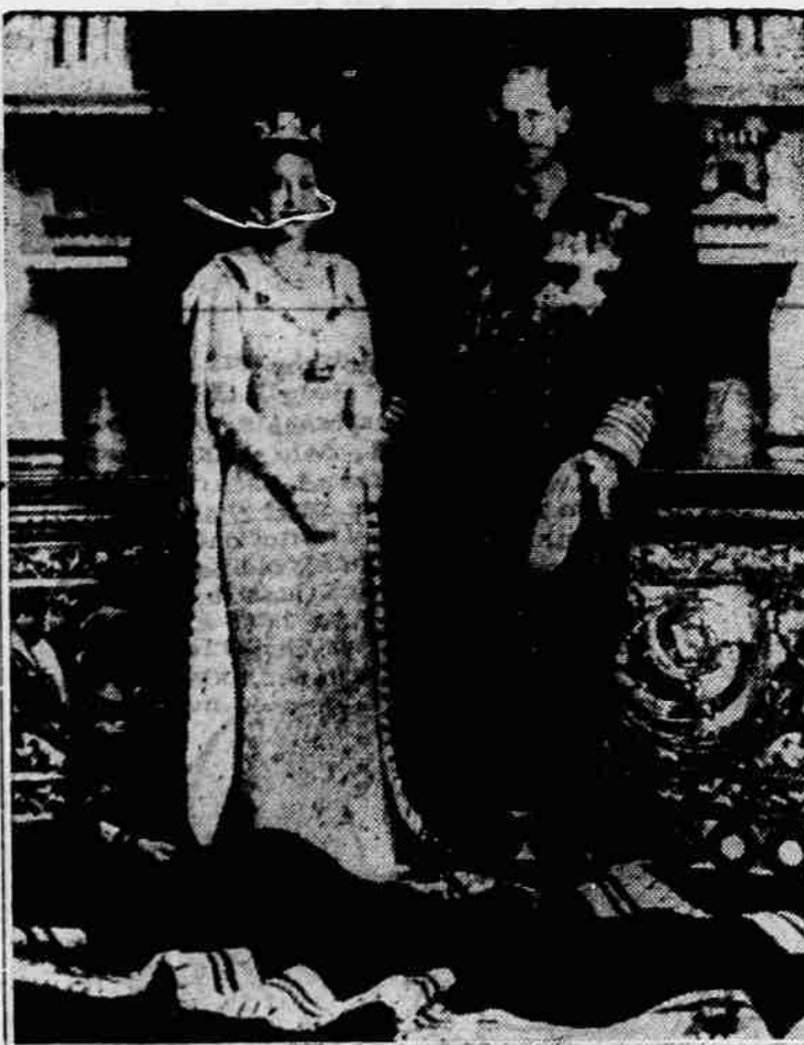
ROYAL PORTRAIT —Britain's Queen Elizabeth II and Prince Philip face the camera at Buckingham Palace in London for this new official photo by Anthony Armstrong-Jones. The Queen wears her long-trained Parliamentary Robe and a tiara of diamonds and pearls. Prince Philip wears uniform of an Admiral of the Fleet. Both wear Collar of the Garter.

To Install Installation of officers will be held at a meeting of Medford Jaycees set for tonight at 8 o'clock at Tally Ho restaurant on Highway 99 south. The export of wines is worth nearly $2,250,000 a year to Australia on a yearly average.