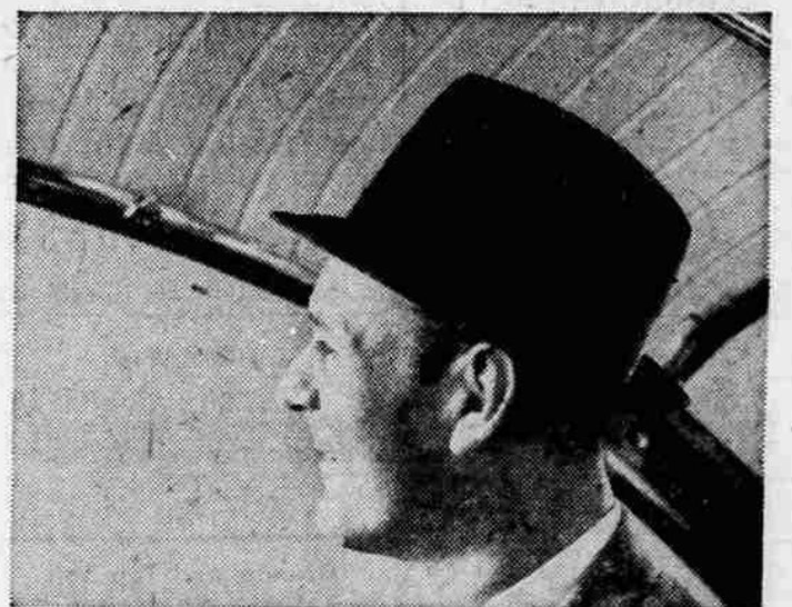
EASY TO RELAX IN