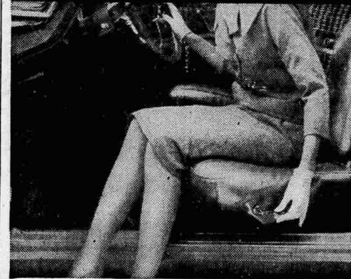
PLYMOUTH'S SO EASY TO GET IN