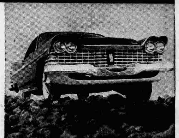
EASY TO RIDE IN