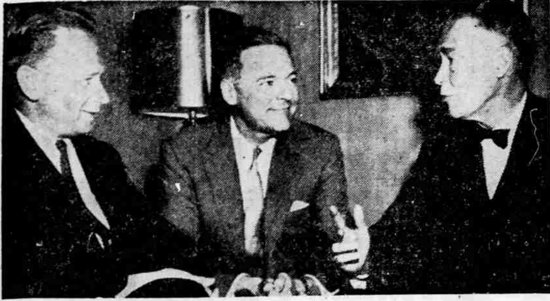
'EXCHANGE OF VIEWS'—United Nations Secy.-Gen. Dag Hammarskjöld (left) meets with Secy. of State Christian A. Herter (right) at the State Department in Washington for an "exchange of views" on world problems. In center is Henry Cabot Lodge, U.S. ambassador to UN.