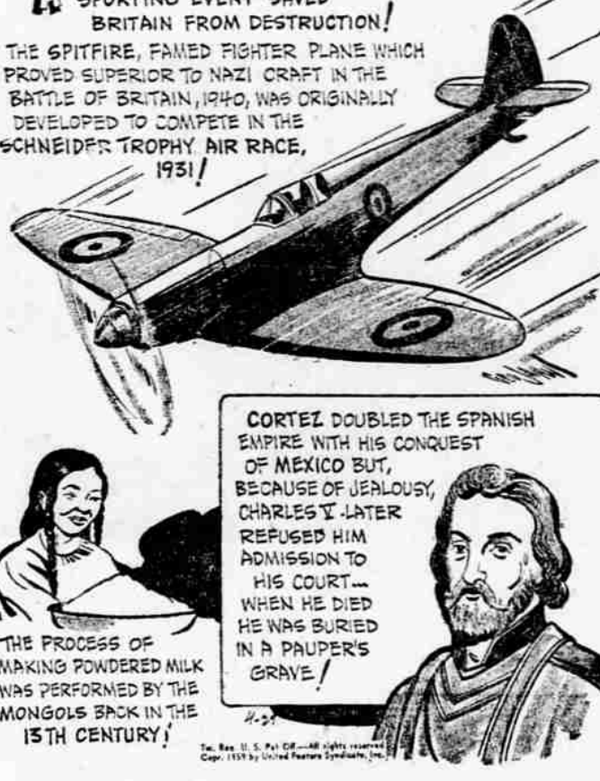
CORTEZ DOUBLED THE SPANISH EMPIRE WITH HIS CONQUEST OF MEXICO BUT, BECAUSE OF JEALOUSY, CHARLES V LATER REFUSED HIM ADMISSION TO HIS COURT - WHEN HE DIED HE WAS BURIED IN A PAUPER'S GRAVE!

SPORTING EVENT SAVED BRITAIN FROM DESTRUCTION! THE SPITFIRE, FAMED FIGHTER PLANE WHICH PROVED SUPERIOR TO NAZI CRAFT IN THE BATTLE OF BRITAIN, 1940, WAS ORIGINALLY DEVELOPED TO COMPETE IN THE SCHNEIDER TROPHY AIR RACE, 1931!