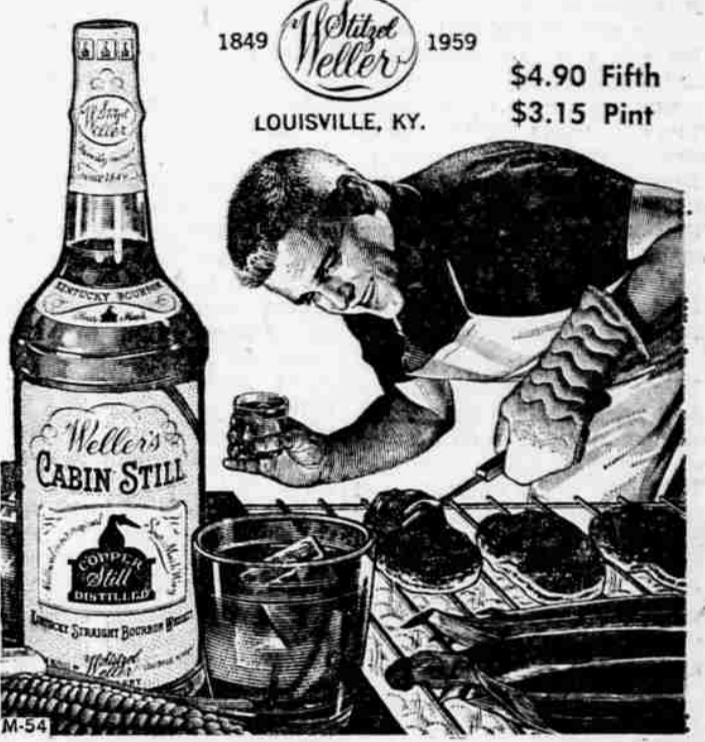
1849 Weller 1959 LOUISVILLE, KY. $4.90 Fifth $3.15 Pint

Always distilled, aged and bottled only by America's Oldest Family Distillery