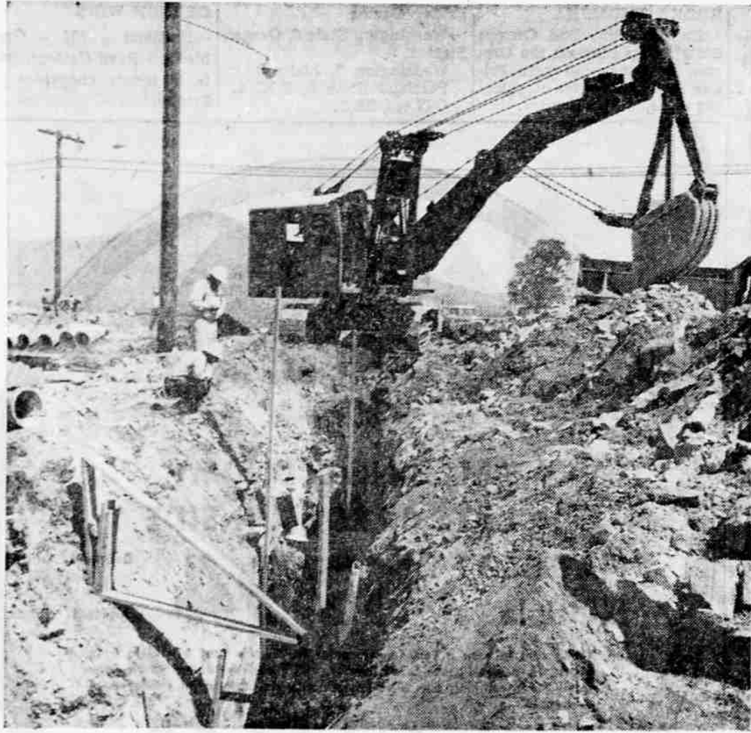
BLAST SITE - Three men working in this ditch on the Kenwood - Grandview sewer project Friday escaped with minor injuries when the backhoe's shovel apparently struck a blasting cap and charge remaining from previous excavation work and caused a detonation. The men, Blaine Biles, 44, of 819 Taylor st., Medford, L. Melvin C. Sheftad, 50, of The Dalles, and Milford D. Waters, 49, currently of Lazy L motel, Medford, were rushed to Sacred Heart hospital for treatment of minor cuts - but were back on the job that same afternoon. The ditch parallels Grand ave. at Crater Lake ave.