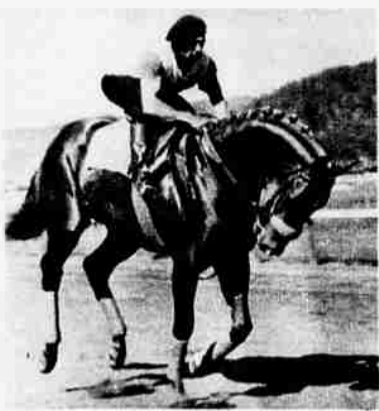
Sensational Silky Sullivan disappointed fans in '58 run.