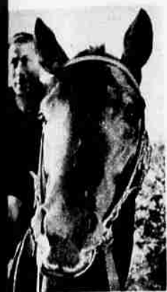
Tim Tam was one of the favorites to win.