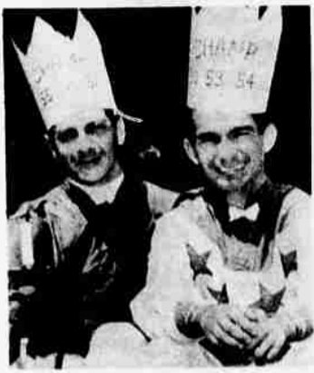
Top jockies like Hartack, Shoemaker had their woes.