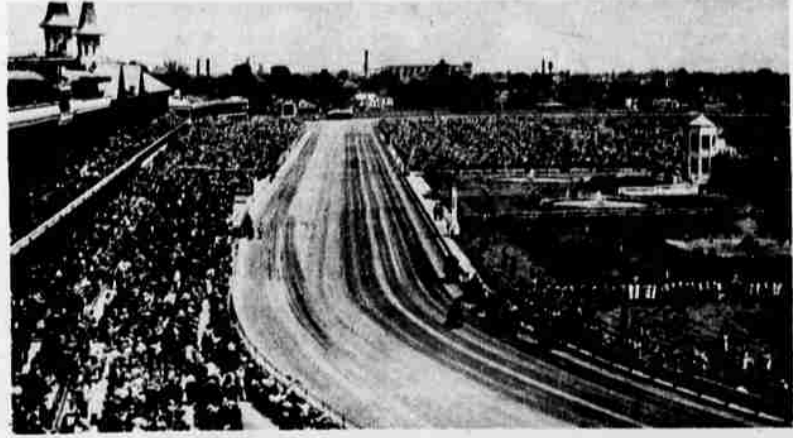
Perhaps not the best race track, Churchill Downs is surely most famous, historic.

About the only "sure thing" at Churchill Downs next Saturday will be some two minutes of top thoroughbred racing.