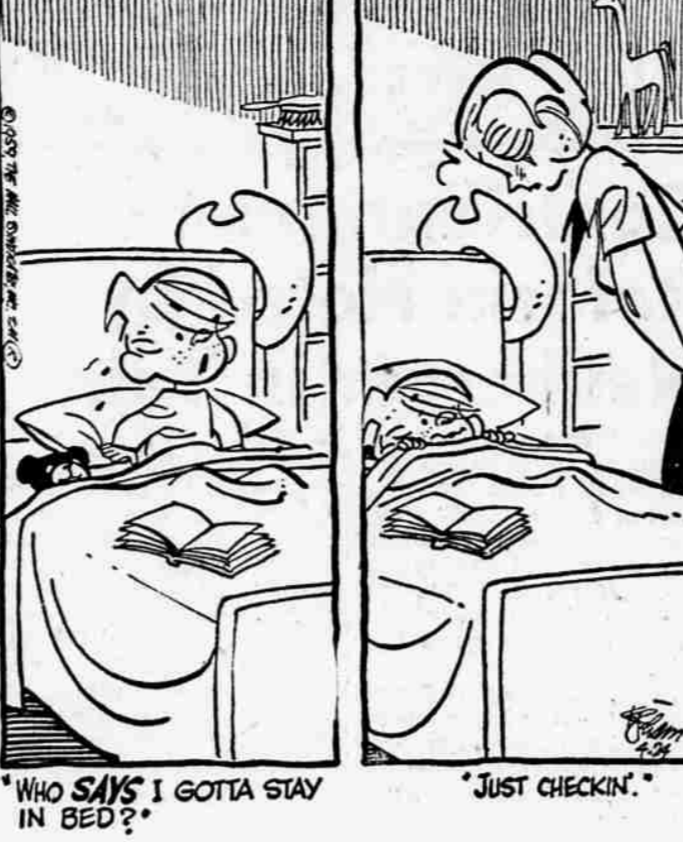
Who says I gotta stay in bed? Just checkin'.