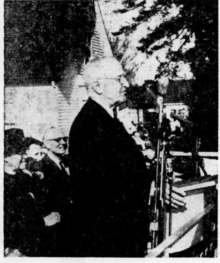
TRUMAN BIRTHPLACE NOW A SHRINE —Former President Harry S. Truman is pictured during ceremony dedicating his Lamar, Mo., birthplace (background) as a public shrine. The house was given to the State of Missouri by the United Auto Workers Union. Truman was born in the house on May 8, 1884.