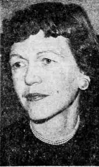
MAURINE NEUBERGER Delegate to Congress

The bonds were sold to Halsey, Stuart and company.