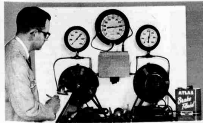
DESIGNED TO STOP YOU ON A DIME...Atlas Brake Fluid must give outstanding braking power before Atlas Automotive Specialists will pass it. Such constant testing is your guarantee of proved top value.