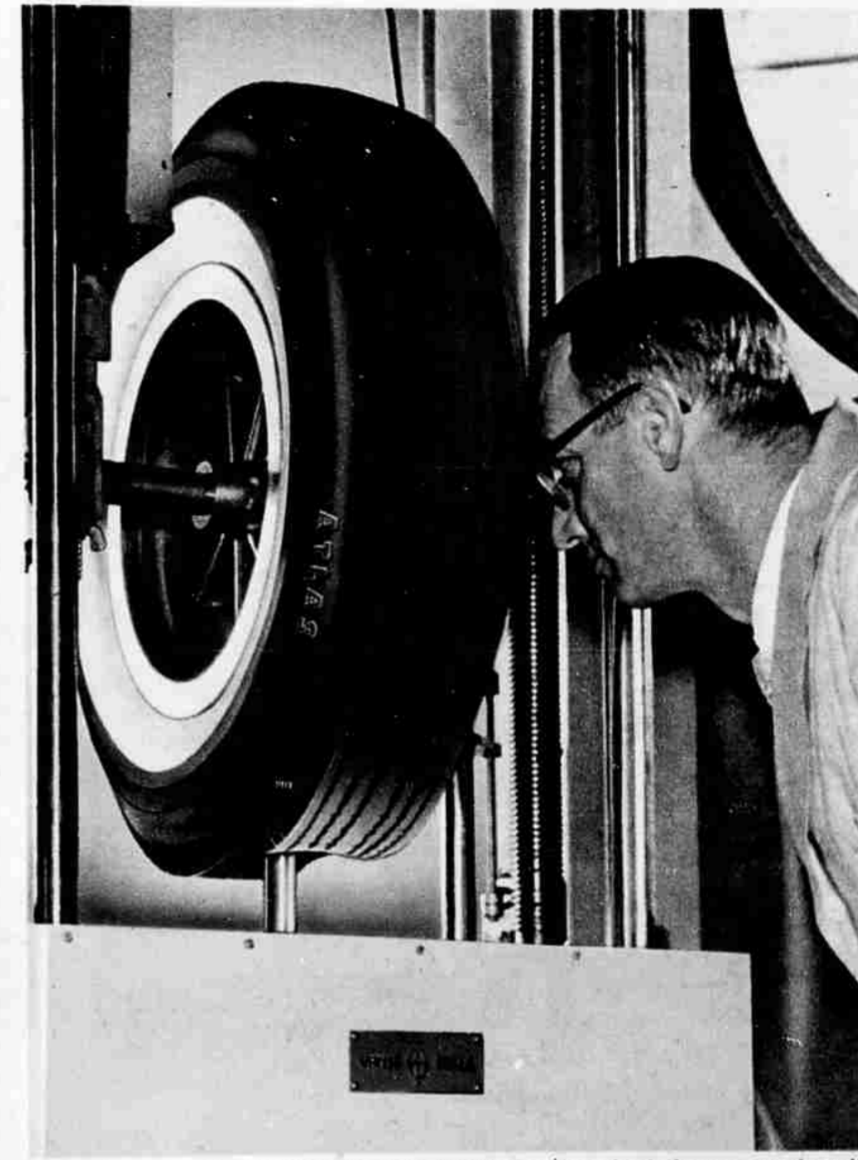
IN TESTS Atlas gives them the most thorough going-over...like this test (shown in picture above) to check tire carcass strength.

Extra safety...extra stamina...extra long life...Atlas Automotive Specialists build and test Atlas Products to specifications even higher than for those that came on your new car! No wonder more dealers sell Atlas Tires and Batteries than any other brand in the world. No wonder their guarantee is honored on the spot coast-to-coast. Yet, you pay no more than for ordinary products!