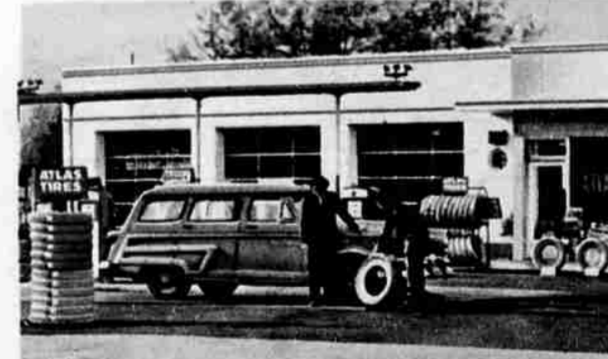
GUARANTEE HONORED ON THE SPOT. Ask your Atlas dealer to show you the famous written guarantee on Atlas Tires and Batteries. It's honored wherever you go, from coast to coast.

SOLD AND GUARANTEED AT 38,000 SERVICE STATIONS IN ALL 49 STATES AND CANADA