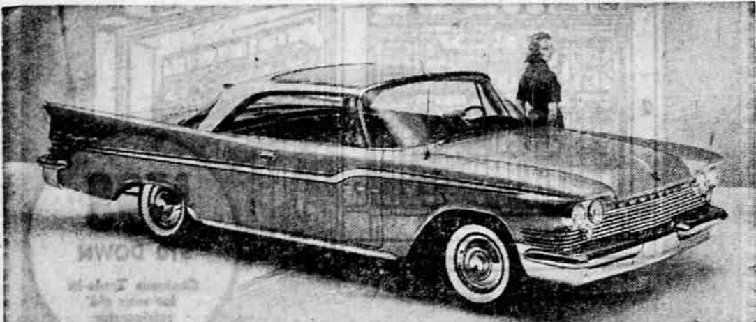
ADVANCED STYLING —On display at Hamlin Motor company is the 1959 Chrysler Windsor two-door hardtop, powered by a 305-horsepower engine. The car has new two-tone roof design, push-button air-conditioner and heater controls, advanced torsion bar suspension and extra-large rear window.