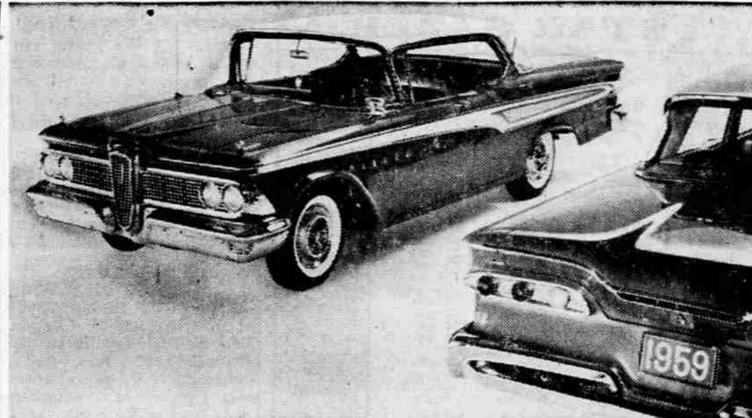
REPOSITIONED —To make it "America's most practical car," manufacturers of the 1959 Edsel report that it has been repositioned in price and size. Offered in a selection of 10 models in three series, the Edsel has increased passenger space with no added overall length, reduced total weight and a wide selection of economy engines and transmissions. Shown here is the Corsair four-door hardtop (left) and the rear of the Ranger four-door sedan, both on display at Medford Motors, 225 South Riverside ave.