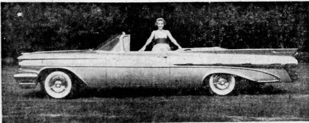
NEW BONNEVILLE CONVERTIBLE —Unprecedented styling innovations, resulting in a lower, wider car, give the 1959 Pontiac Bonneville convertible a dramatically new appearance. Dean and Taylor Pontiac company are the Medford dealers. The convertible has seats trimmed in leather and Morrokide, is mounted on a 124-inch wheelbase chassis with an overall length of 220.7 inches. Front bucket seats are optional. The four-door Vista hardtop and richly appointed Safari supplement the Bonneville.