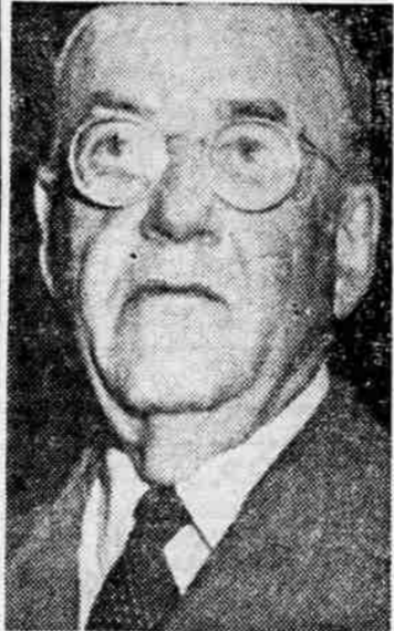
DECIDED? —Quoting sources "believed to be reliable," a CBS news correspondent said that Secy. of State John Foster Dulles (shown here in file photo) has decided to resign. The correspondent, Dan Schorr, says that Dulles recommended Undersecy. of State Christian Herter as his successor.

Washington — (UPI) — High official sources disclosed Saturday that Nationalist China is preparing to withdraw some of its troops from embattled Quemoy and replace them with increased firepower supplied by the United States.