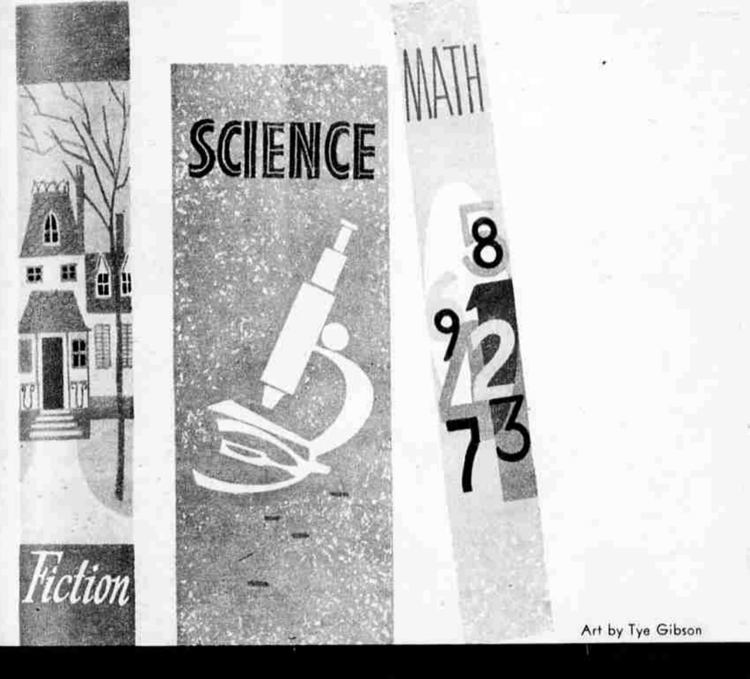
Art by Tye Gibson