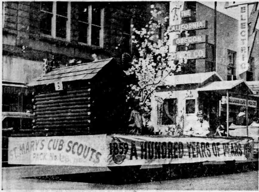
'WINNING FLOAT' - Announced as sweepstakes winner for the best theme portrayal in the Pear Blossom parade in Medford yesterday was this float entered by the St. Mary's Cub Scouts. The float, depicting "100 years of pears," displayed a replica of a log cabin on one end and a modern home complete with crepe paper blossoms. Sweepstakes winner in the best design class went to the Eagle Point Jaycees.

If regular delivery arrives shortly after you call please notify office thus eliminating special messenger service.