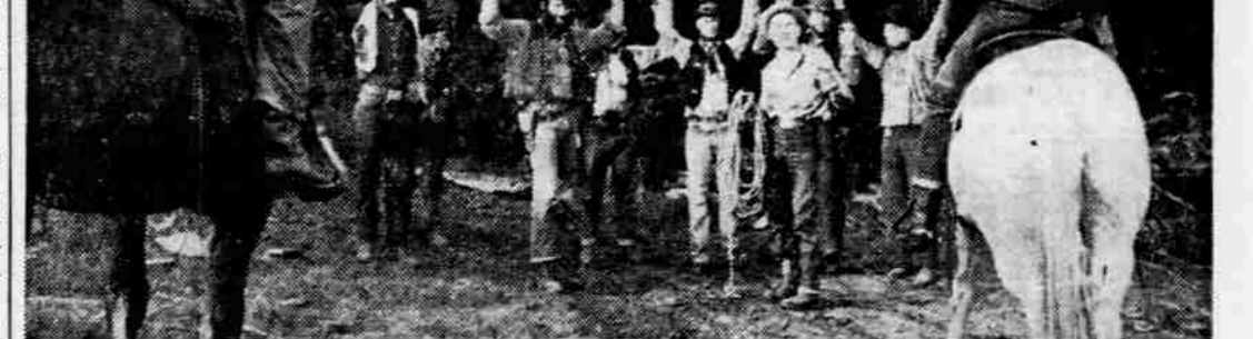
CAPTURED —A group of vigilantes Thursday captured the "Black Dog Bandits" after their hideout in the woods in northern Jackson county. The "bandits" two weeks ago staged a "raid and holdup" in Butte Falls.

Rumors have been heard about a possible "escape."