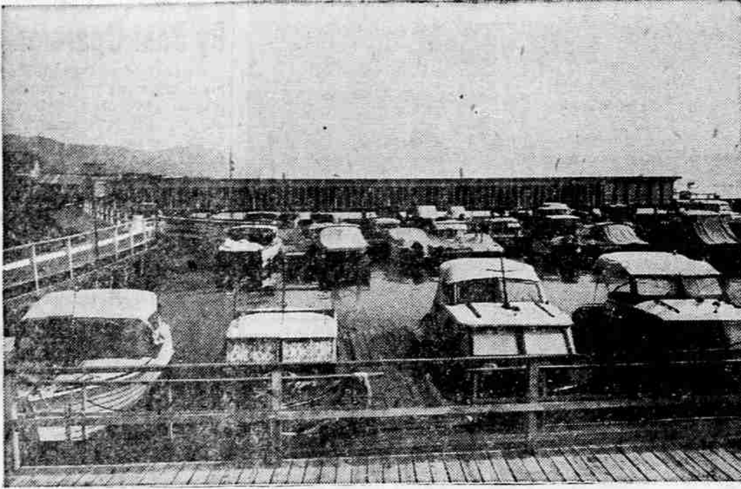
INSTALLATION —Edgewater Marina, Edgewater, N.J., is an example of a well planned installation. The U.S. needs more of these facilities to accommodate the thousands of new boats in the water.

About 200 billion out of America's estimated annual production of 485 billion matches are given away with the purchase of retail tobacco products.