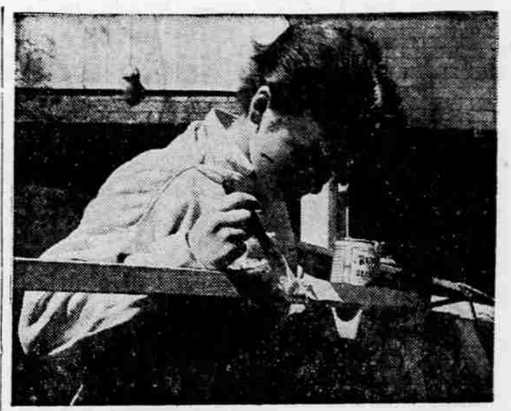
DO-IT-YOURSELF —This smart gal gets fun out of building the boat as well as sailing it.

MISHAPS KILL 16 Seoul, Korea — (UPI) — Sixteen persons died Tuesday in two separate mishaps in the republic of Korea. Nine passengers were killed when a bus crashed into a reservoir near Pohang. Near Taegu seven persons, including five in one family, died after eating vegetables sprayed with a poisonous insecticide. BEARS THWART FIREMEN Komatsu City, Japan — (UPI) — Several hundred fire fighters fled a forest blaze Monday just two steps ahead of three frightened grown up bears and two bear cubs. More than 125 acres burned before the police shot the bears and the firemen got back to work.