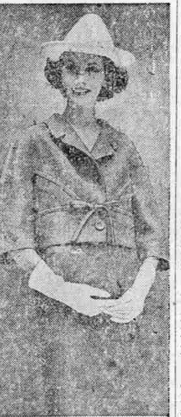
BOXY JACKET —Generous boxy jacket with high-rise detail is counterbalanced by slim skirt of this suit. By Jack Sarnoff in English Quicksand worsted.

The heaters, a refinement of those used in drive-in theaters in cold weather, are suspended from the ceiling of a plastic-sided canvas tent. They operate on either natural or propane gas, and eventually may be used to warm building lobby entrances, enclosed swimming pools and the interior of trucks where food products must be kept warm while on the road.