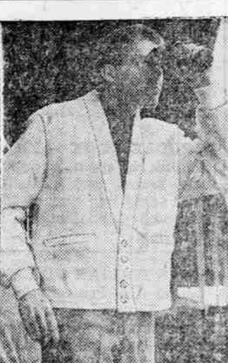
NEW TREND —Knitted wool jackets are the new trend in leisure time, coupled with a continued high buying power of the public are considered the primary impetus behind last year's record boating business volume.