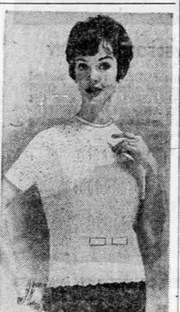
SIMPLE DESIGN —Simply designed to emphasize the fabric is this eyelet-embroidered broadcloth blouse. Bow trim suggests a "lifted look." By Rhoda Lee.

Cruising over the waterways of the nation, the power boat fleet—some 4,415,000 in-borders, outboards and auxiliaries—burned 404 million gallons of gasoline, 22 million gallons of diesel fuel and 20 million gallons of lubricating oil.