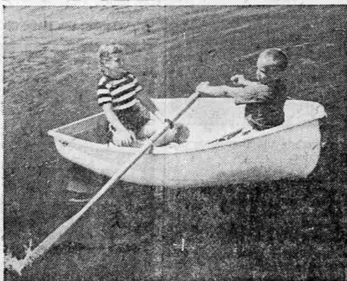
VARIED SIZES —Fun afloat is for all ages no matter what size boat you have. A fleet of 42-foot Matthews cruisers raft up in a gala rendezvous (top) while two youngsters have their own kind of adventuresome fun in a tiny fiber glass dinghy (below).