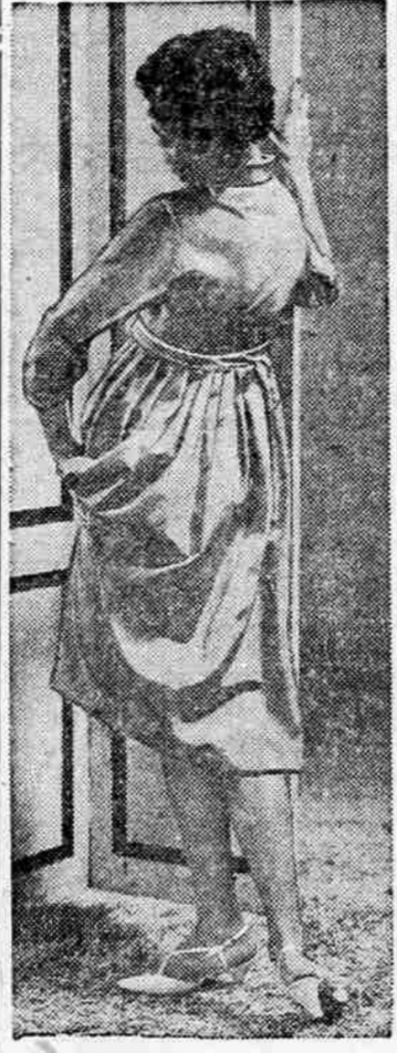
LEISURE TIME — Suggested for leisure time is high-waisted pink silk robe with pleated back, complemented by seamless stockings in "Hot Pink." The stockings by Hanes.

Two new power classifications are included in the 20th anniversary Mercury motors: 15 and 35 hp models. The two-cylinder 15 hp brings the number of fishing class motors to four — six, 10, 15 and 22 hp. The four-cylinder "35" gives the firm five models — 35, 40, 45, 60 and 70 hp — the upper power range. Prices for 1959 range from $225 for the six hp to $925 without propeller for the 70 hp model. The new Mark 15A is priced at $345 and the new Mark 35A at $480. Mercury has also reduced prices on the Mark 10, to $310, and the Mark 28A — 22 hp model — to $410, both $20 less than in 1958.