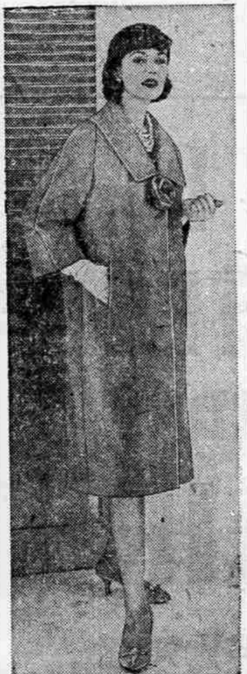
FOR LATE DAY — Widened collar, self-rose give top interest to cashmere coat for late day. It's lined with silk print. By La Vigna in Einiger cashmere.