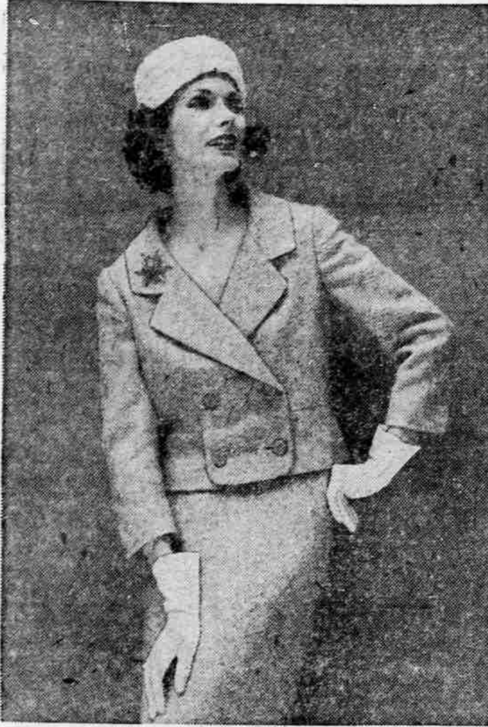
EMPIRE THEME —Modern interpretation of the empire theme creates a thoroughly contemporary fashion for the spring wardrobe. In geranium pink British woolen mohair, this softly tailored suit has a standaway notched shawl collar, low double-breasted front, gathered back. By George Carmel.