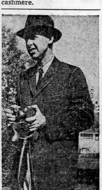
BRIGHT COLORS — Warm weather sportswear features lightweight fabrics and bright colors, as in this sport coat with burgundy and gold on navy. Fabric is blend of "Dacron" and cotton.