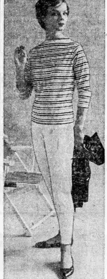
CHALK WHITE — Separates story, told in black and white, features chalk white tapered pants, striped pullover. "Permathal" "Everglaze" cotton knit.